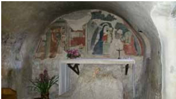
Greccio

Francis continually contemplated and marvelled at three mysteries in the life of Jesus: the humble descent of God into our flesh and blood in the Incarnation of Jesus, the humble descent of Jesus into the darkest depths of our lives in his suffering and Jesus' humble self-giving to humanity in the Eucharist.