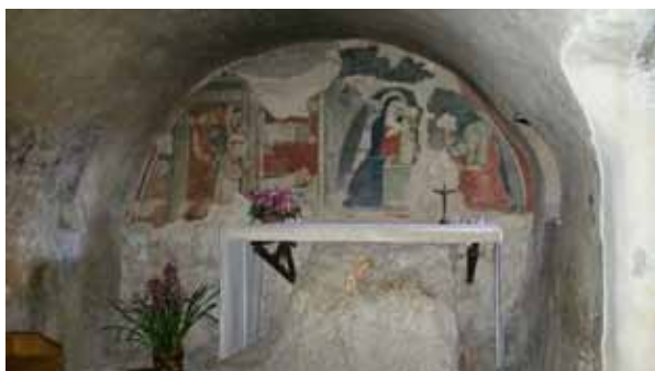
Greccio

Francis continually contemplated and marvelled at three mysteries in the life of Jesus: the humble descent of God into our flesh and blood in the Incarnation of Jesus, the humble descent of Jesus into the darkest depths of our lives in his suffering and Jesus' humble self-giving to humanity in the Eucharist.